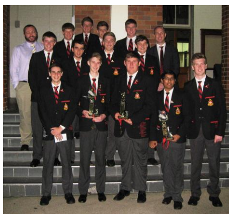
U14 Black (left)/ U14 Red (right)